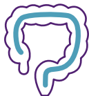
A Change in stool (oily or watery)