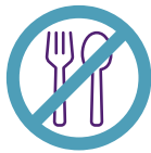
Nausea/loss of appetite